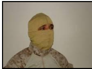
1 ea. light weight 1 ea. mid weight