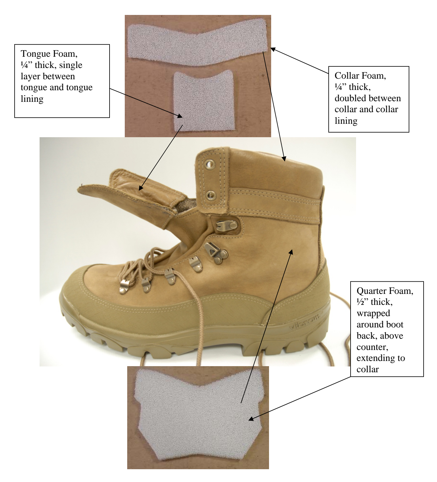
FIGURE 8. Mountain Combat Boot – (foam configuration)