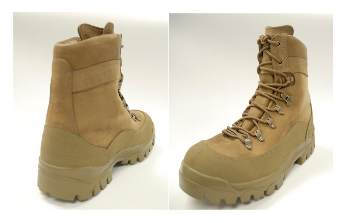
FIGURE 6. Mountain Combat Boot (back and front view)