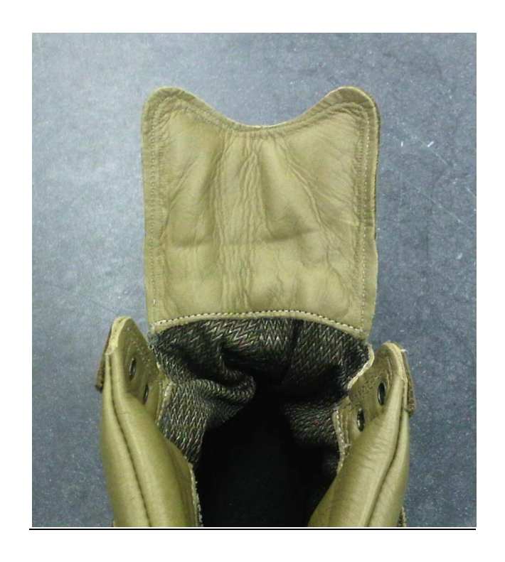
FIGURE 2B. Mountain Combat Boot - Tongue Lining