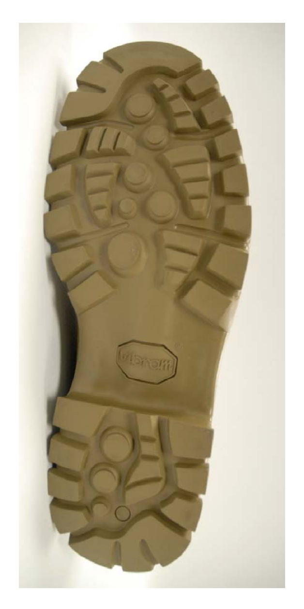
FIGURE 7. Mountain Combat Boot (tread view)