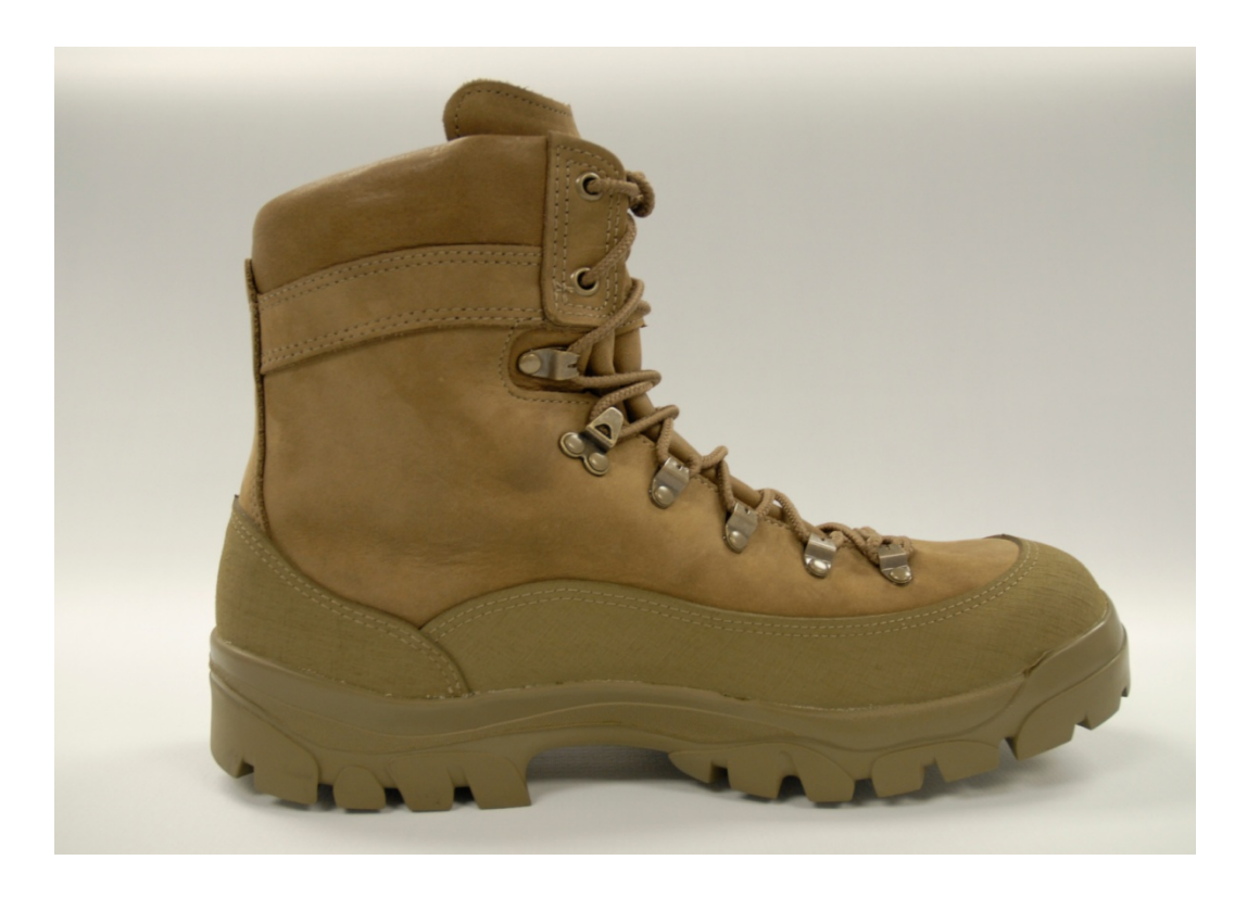
FIGURE 5. Mountain Combat Boot (medial view)