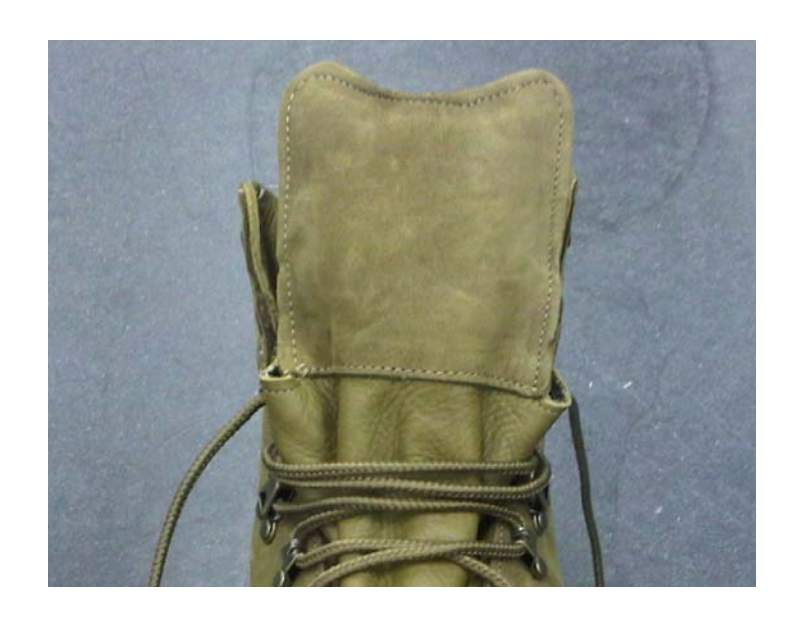
FIGURE 2A. Mountain Combat Boot - Tongue