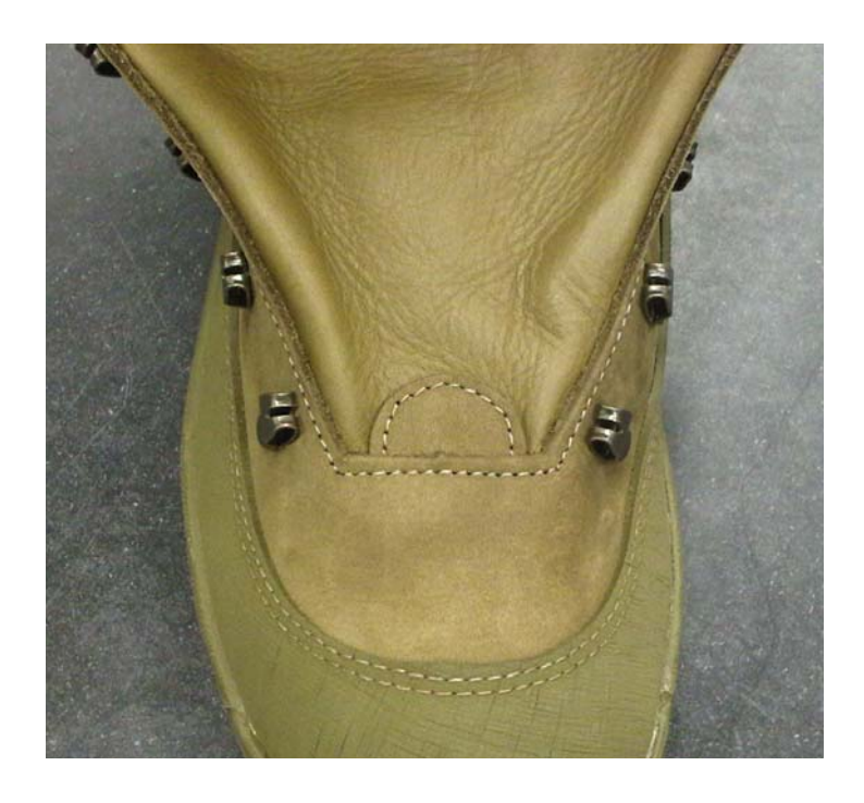
FIGURE 3. Mountain Combat Boot - Plug at Bottom of Gusset