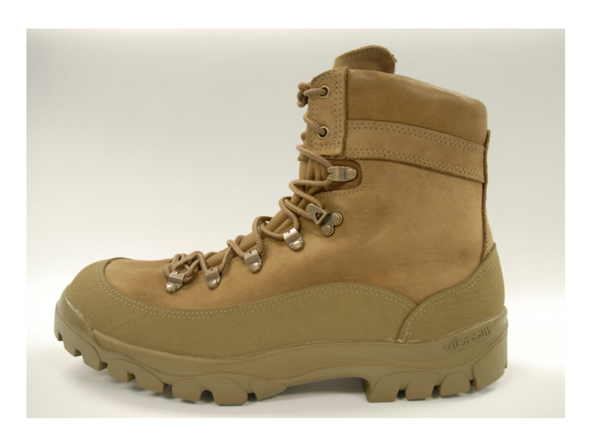
FIGURE 4. Mountain Combat Boot (lateral view)