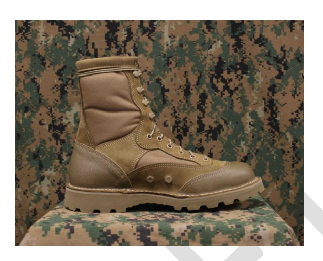
Figure 2B. Lateral (Outside) View