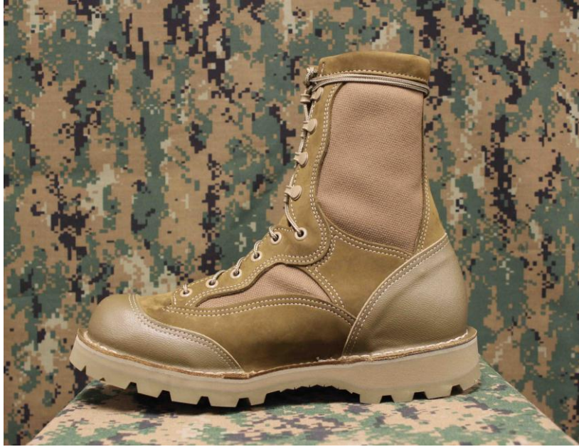
Figure 2B. Lateral (Outside) View