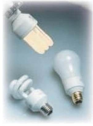
Many types of commercially made light bulbs are assigned NSNs

The NSN is officially recognized by the United States government, the North Atlantic Treaty Organization (NATO), and many governments around the world. Federal Agencies, including the Department of Defense (DOD), use the NSN to buy and manage billions of dollars worth of supplies yearly. Currently, there are over 6 million NSNs in the federal supply system.