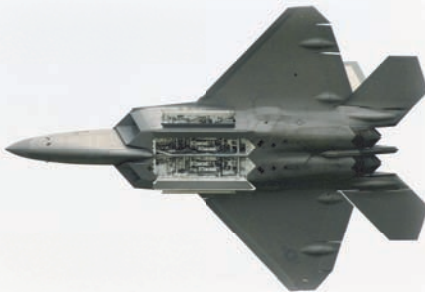
The United States Air Force's F/A-22 Raptor. Thousands of Raptor parts are assigned NSNs.

NSNs are used to identify and manage nearly every imaginable item, from aircraft parts to light bulbs . The use of NSNs facilitates the standardization of item names, supply language, characteristics and management data and aids in reducing duplicate items in the federal inventory. It also helps to standardize the military requirements for testing and evaluation of potential items of supply, as well as identifying potential duplicate items.