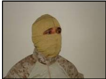
1 ea. Light weight 1 ea. MID weight