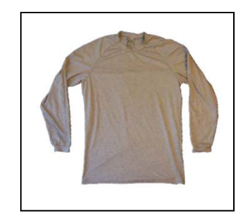
FROG I – Initial fielding