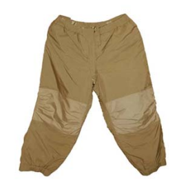
Extreme Cold Weather Parka, Trouser, and Bootie (Happy Suit)