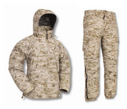
Lightweight Exposure Suit