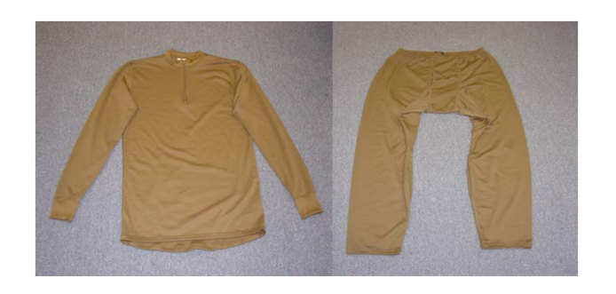
Underwear, Next-to-skin, Cold Weather