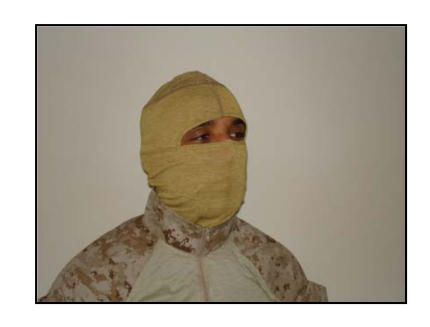
Long Sleeve FR Undershirt