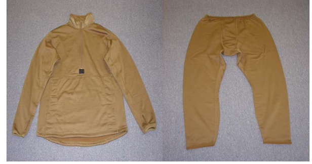
Underwear, Grid Fleece, Mid-Weight, Cold Weather