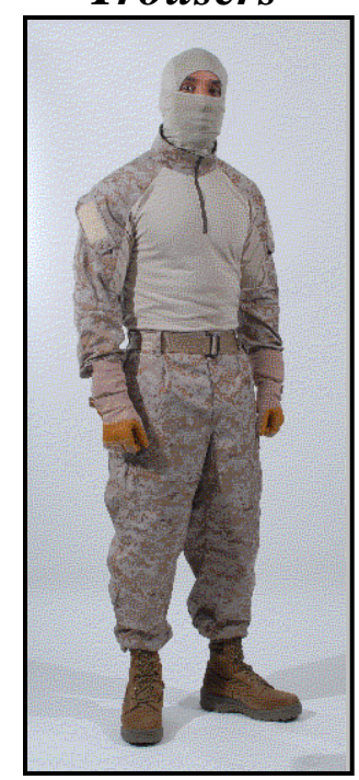
Fielding began APR 07