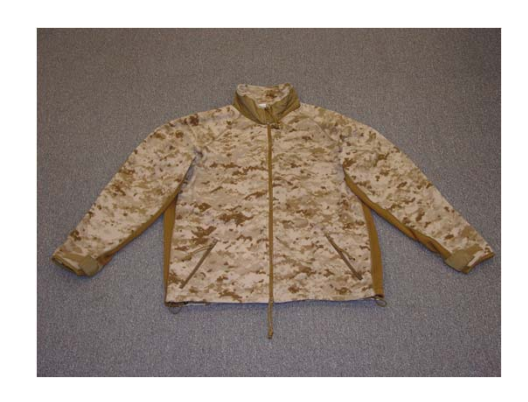
Jacket, Windpro Fleece, Cold Weather