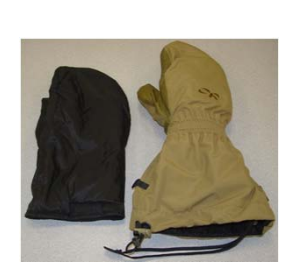
USMC Extreme Cold Weather (ECW) Mitten System