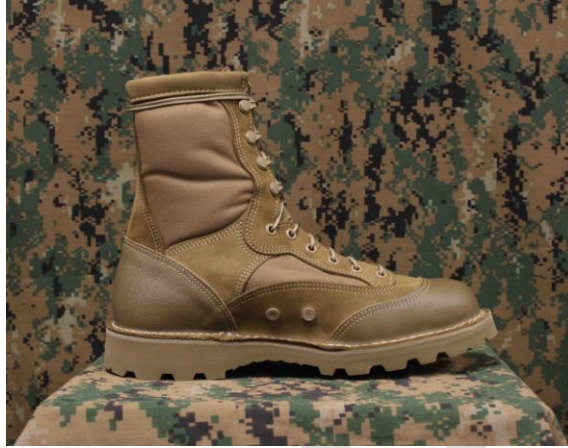
Figure 2B. Lateral (Outside) View